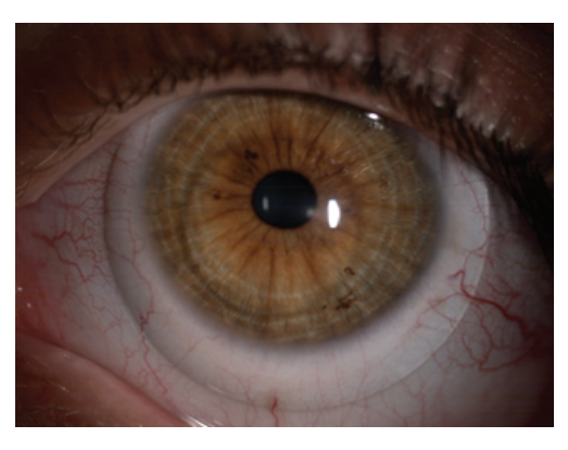
Figure 1: Mild Hyperemia in nasal and temporal conjunctiva of OS with the previous lens.

In 2018 the patient returned for a follow-up and lens replacement. Overtime the lens parameters have changed and the quality of the lenses decreased. During the follow-up there was mild hyperemia detected on the nasal and temporal conjunctiva of the left eye, this increased after removing the lens. (Figures 1 and 2)