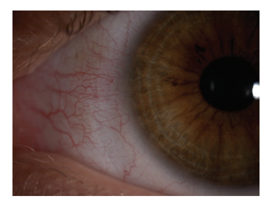
Figure 2: Re-occurring hyperemia in nasal conjunctiva after removing the lens.