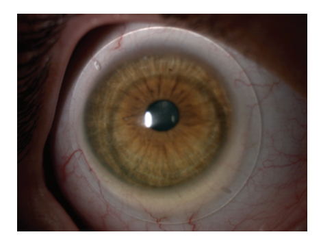
Figure 5: Right lens with 125microns toricity and stabilization marks corresponding the flattest meridian oriented to 140 degrees, matching the meridian suggested by the ESP.

Following the results of the ESP measurement new lenses with a toric haptic were fitted in both eyes, expecting to relieve the compression in the lower meridian and maintaining the alignment in the opposite meridian. The difference of 130 microns had to corrected by the lenses with a toric haptic zone, the lenses used offered toricity steps of 25 micron, due to this 5 steps off toricity were added (125 micron). The final ordered lenses were 15.5 ICD Flexfit for both eyes with a height of 4000 micron, PCCZ 0, LCZ 0/Steep +5, SLZ 0 for OD and sagitta 3800, PCCZ +4, LCZ 0/Steep +5, SLZ-1 for OS. The lens were well centered and showed no signs of impingement or blanching. The lenses were stabilized with the orientation with the minimum sagittal height on 145 degrees in OD and 20 degrees in OS which is agreeing with the minimal sagittal heights suggested by the ESP. (Figures 5 and 6)